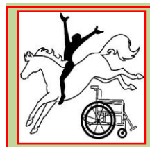
RIDE ON THERAPUTIC