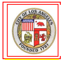
COUNCIL DISTRICT 12